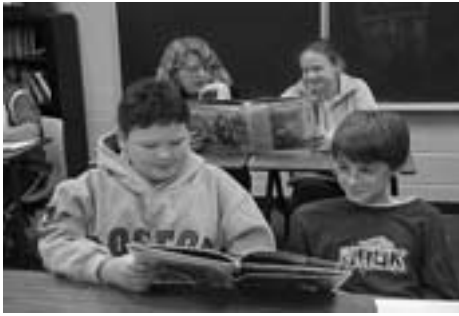
Junior high students work on picture book exercise.

beautiful images, both visual and written, which are easily accessible to readers. Teachers may introduce the idea of using memorable language in writing by using a particular picture book to which students listen, and then by asking students to work individually or in pairs with a picture book of their choice to notice and share similes, metaphors, and other memorable language they find. Owl Moon and Letting Swift River Go by Jane Yolen are excellent examples of books with beautiful language.