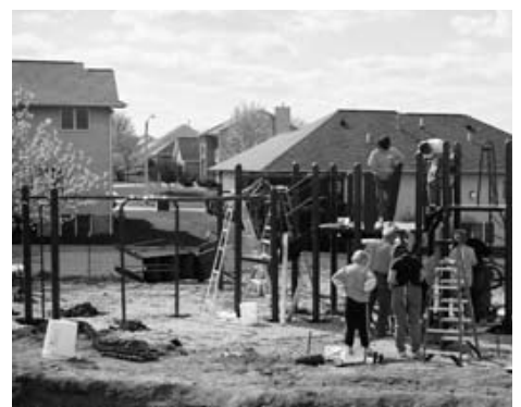
Parents assemble playground equipment at Weber Elementary.