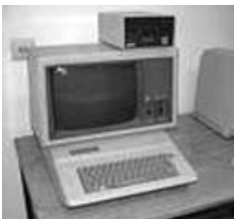
Apple IIe Plus

The Foundation was established in 1981 when the School Board asked a group of concerned parents to study ways to add funds to the school district following significant budget cuts. After six months of fundraising the Foundation purchased an Apple IIe Plus computer in 1982 that was shared among all of the schools in the district. Each school got to use it for just 3 weeks per year!